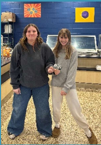
HIGH SCHOOL BREAKFAST SMOOTHIE SAMPLING