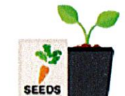
Seeds and plants for food

Michigan Grown Fresh Fruits and Vegetables