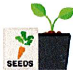
Seeds and plants for food