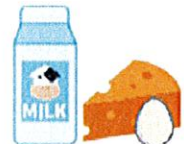
Milk & Cheeses Eggs